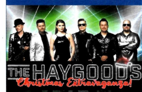
THE HAYGOODS CHRISTMAS SHOW