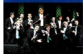
DUBLIN'S IRISH TENORS with special guests THE CELTIC LADIES