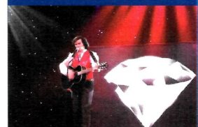
A NEIL DIAMOND TRIBUTE SHOW